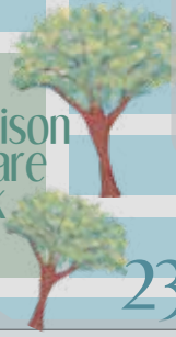
madison square park